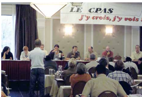
Negotiating Committee at the Symposium for the preparation of the tentative collective agreement

Beyond allocutions and debates, there is no doubt that the PanCanadian solidarity demonstrated at the CUPE National Convention was one of the most outstanding elements of this intense action-filled week. Each day, thousands of CUPE members are working to improve the working conditions of their members. Whether they are small or big locals, it is the strength of thousands of CUPE members demonstrated from October 5th to 9th, 2009, which is motivating them to pursue the mission.