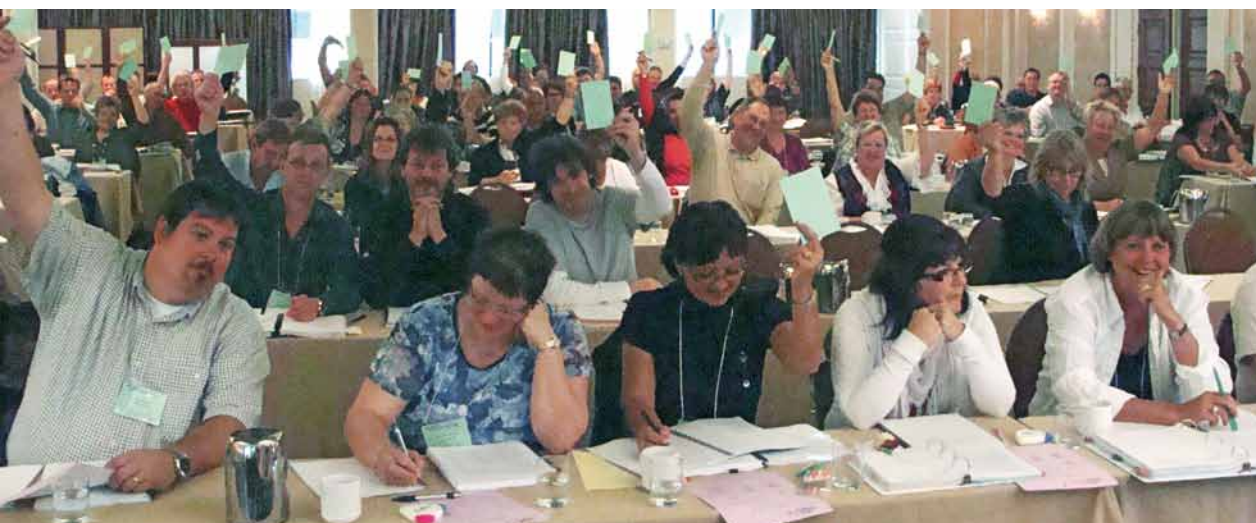
Voting for one of the resolutions at the Symposium